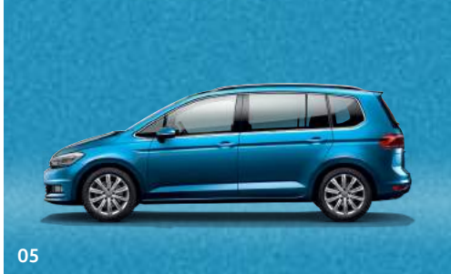
05 S SE SEF SEL RL