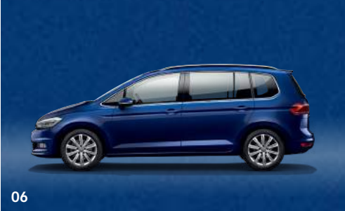
06 S SE SEF SEL