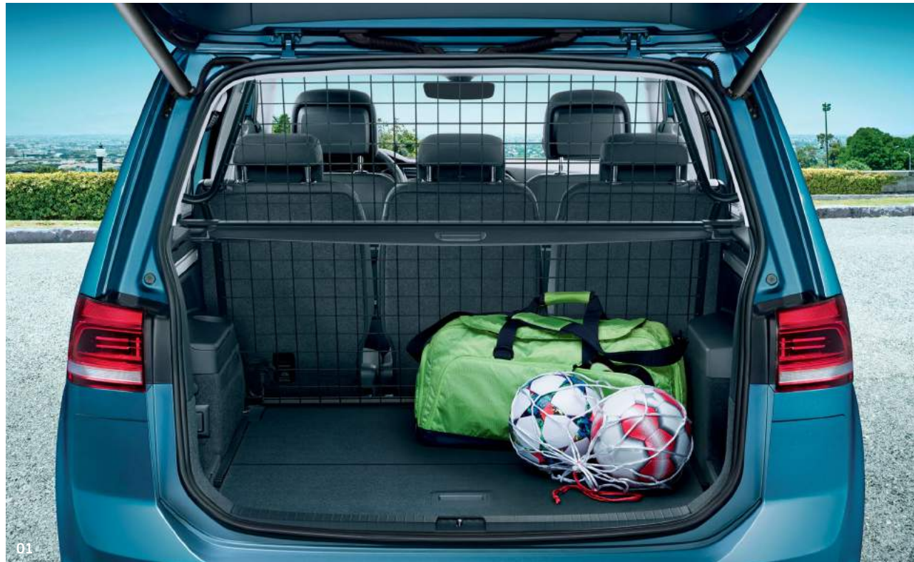
01 Upper partition grille Keep your best friend happily in the back with the partition grille, separating the luggage compartment from the rear passenger space. Made of a black powder-coated tubular frame with wire mesh, it's easily installed behind the rear seat. Part number: 5QA 017 221