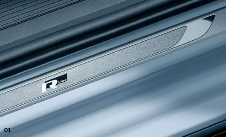
01 Door sill protectors feature unique 'R-Line' styling, emphasising the careful attention to detail that distinguishes the Touran R-Line.

03 The rear bumper with diffuser look effect and twin chrome tailpipe emphasise the sporty style, while rear tinted glass from B-pillar backwards, approximately 65% tinted, gives the R-Line real road presence.