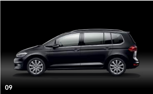
09 S SE SEF SEL RL

Please note: Colour range is reproduced for illustration purposes only. Actual on-car colours may vary from those shown, as print processes do not allow exact reproduction of the paint colours. Models shown are Touran SEL with optional LED premium headlights.