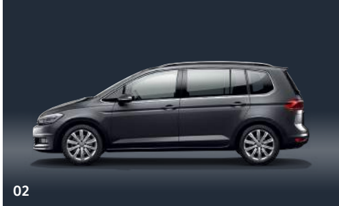
02 S SE SEF SEL RL