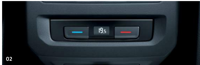
Panoramic sunroof is standard on SE Family and optional on all other models.