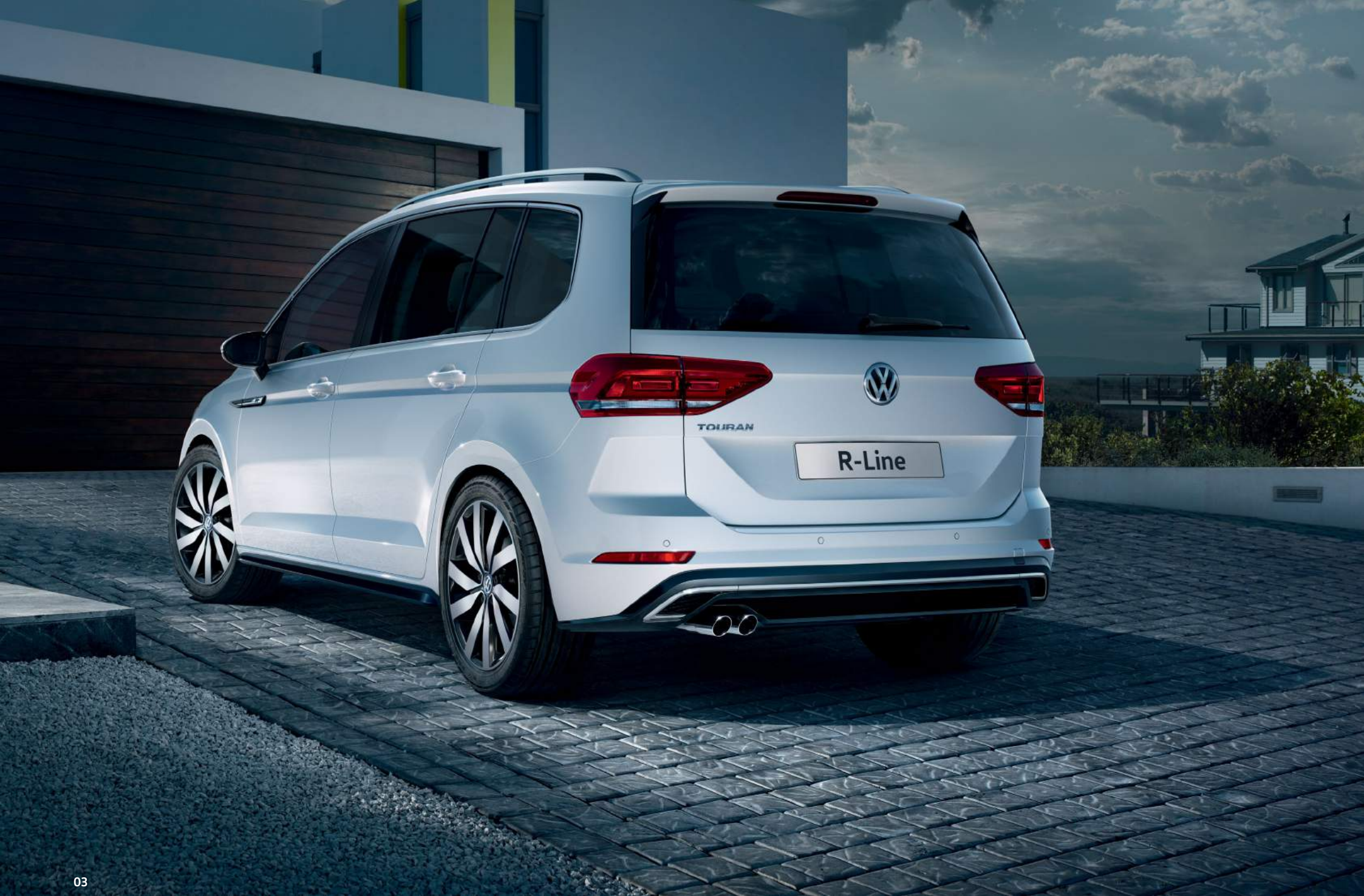
Model shown is Touran R-Line with optional Pure White non-metallic paint.