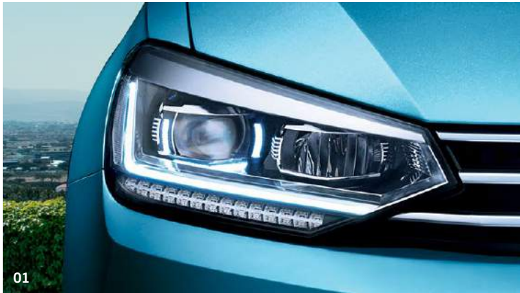
Front cover model shown is Touran R-Line with optional LED premium headlights, panoramic sunroof and Pure White non-metallic paint. Panoramic sunroof is standard on SE Family and optional on all other models.

01 LED premium headlights provide optimum road illumination by producing a light that is brighter than conventional halogen headlights. Also featured with this option is projection technology, LED daytime running lights and dynamic cornering lighting. Optional on SE models and above. Model shown features optional metallic paint.