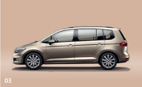
03 S SE SEF SEL