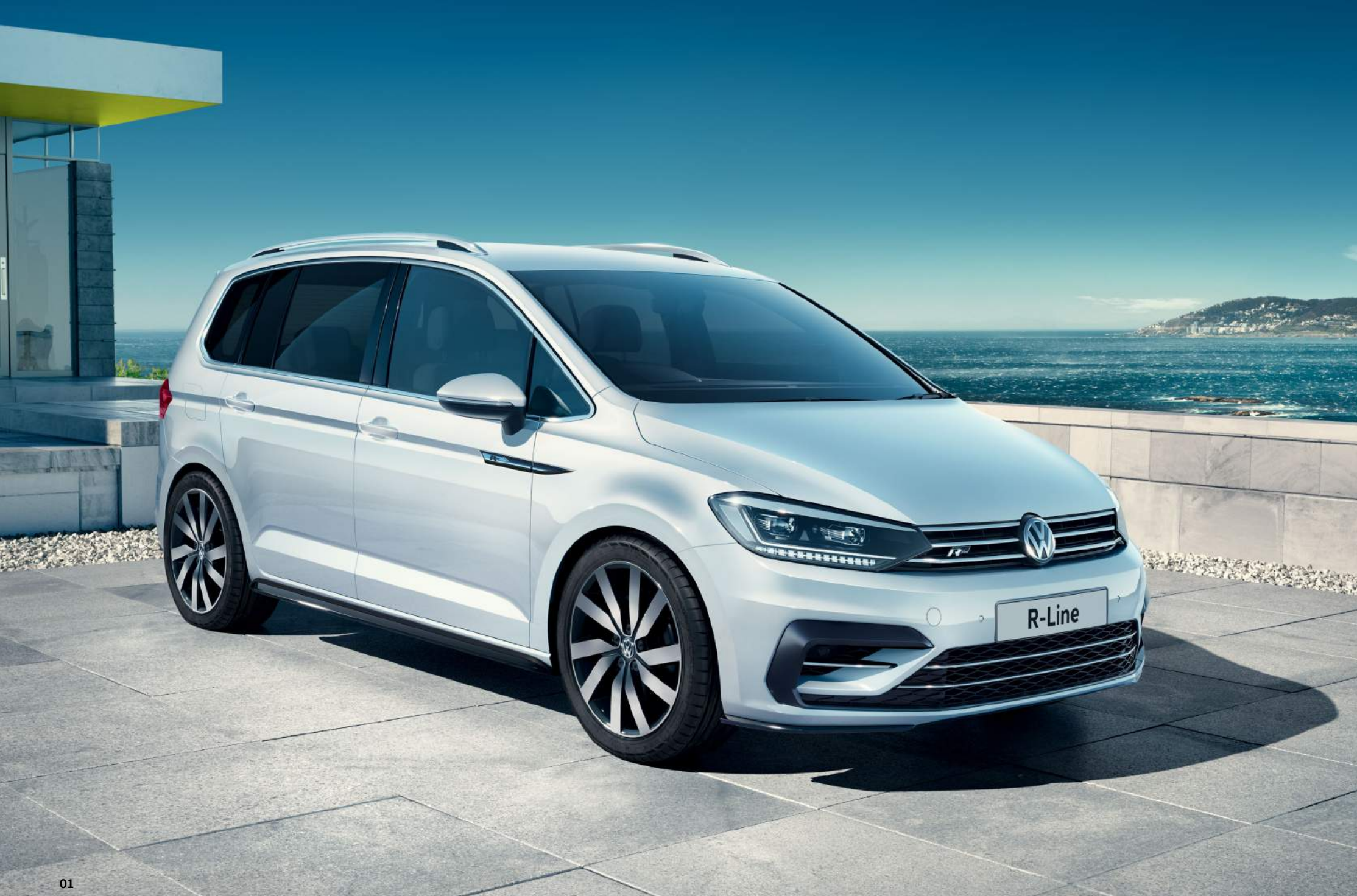
Model shown is Touran R-Line with optional LED premium headlights and Pure White non-metallic paint.