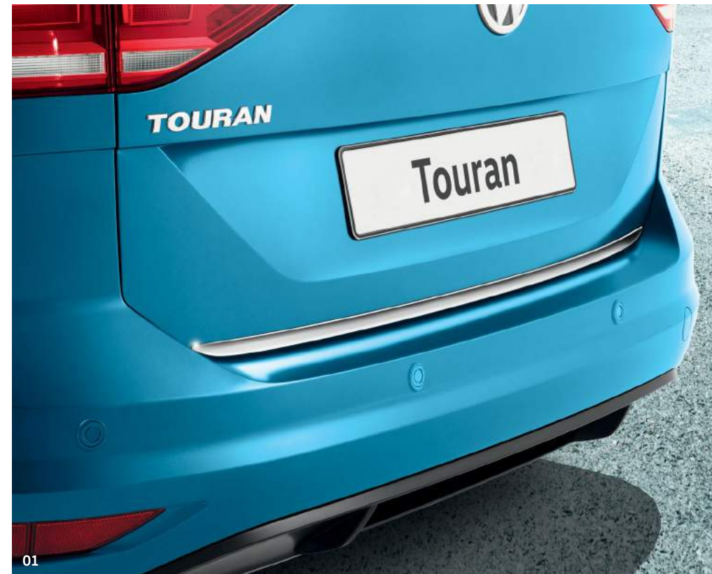
01 Protective strip – chrome A dazzling finish, the chrome-look strip for the lower edge of the rear tailgate gives the vehicle a refined and elegant look and also serves as a sill protector. Part number: 5QA 071 360