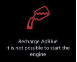
AdBlue® warning lights.