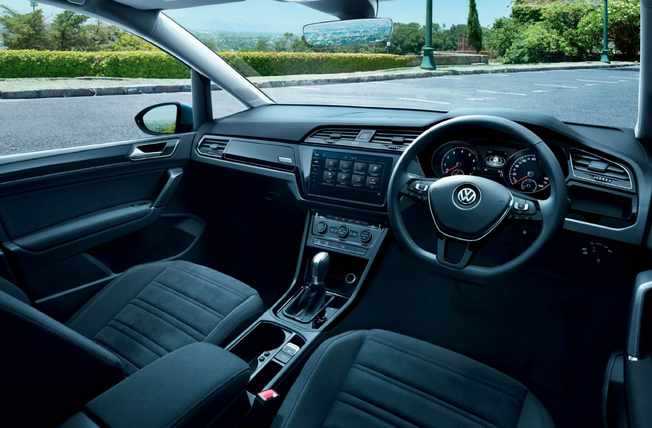
Interior shown is Touran SEL DSG with optional Discover Navigation Pro touch-screen navigation/DVD infotainment system with integrated voice activation and metallic paint.