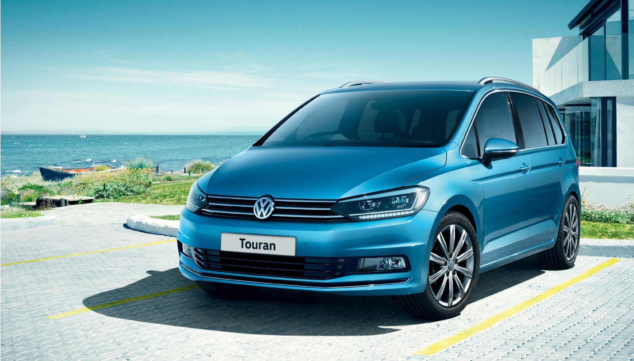
Model shown is Touran SEL with optional LED premium headlights and metallic paint.