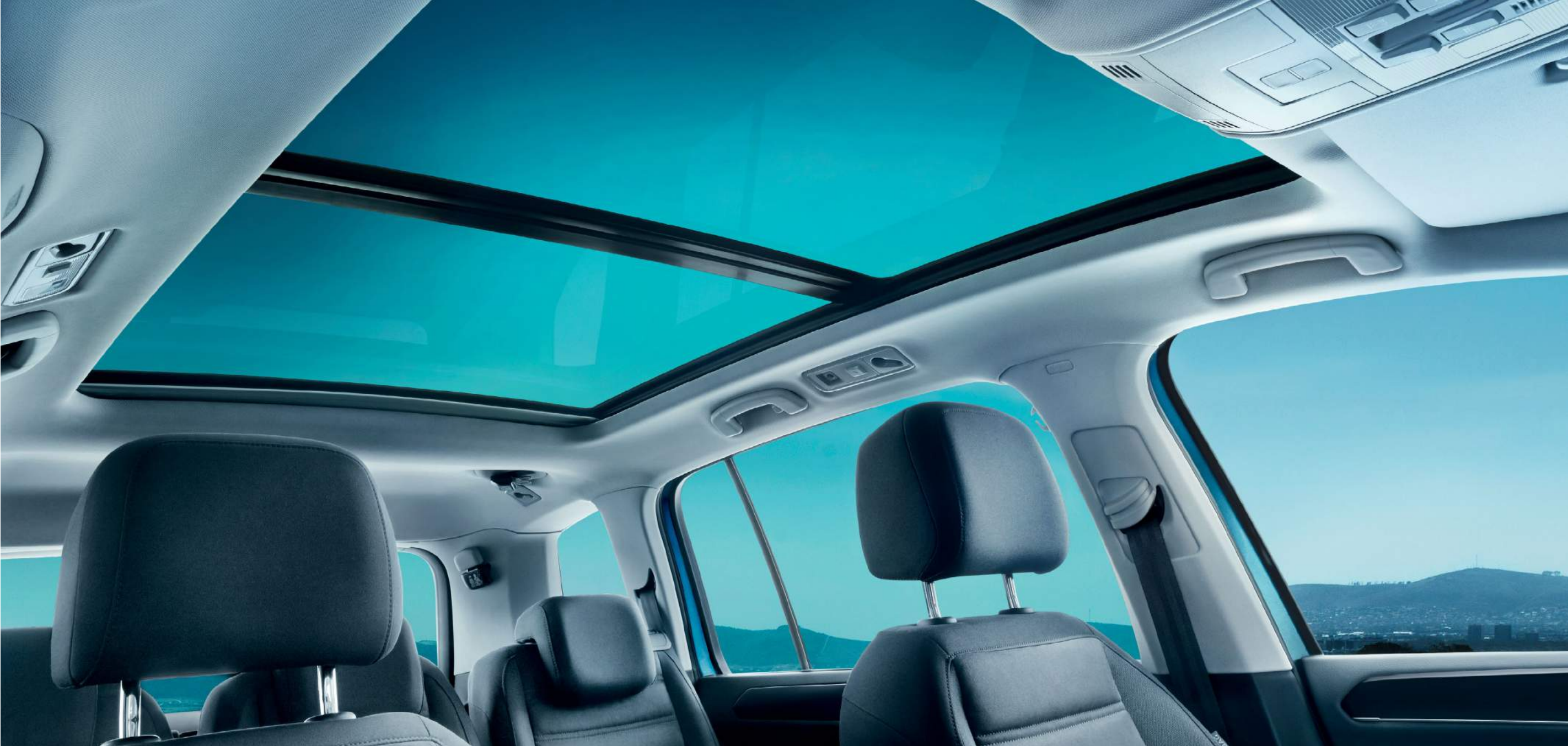
Interior shown is Touran SEL with optional panoramic sunroof, luggage restraint/net partition and metallic paint.