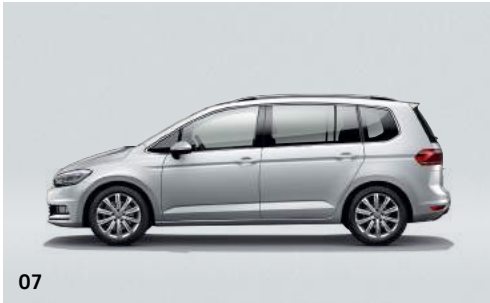
07 S SE SEF SEL RL