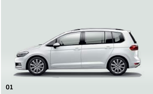
01 S SE SEF SEL RL

Standard Optional S | S SE | SE SEF | SE Family SEL | SEL RL | R-Line