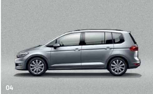
04 S SE SEF SEL RL