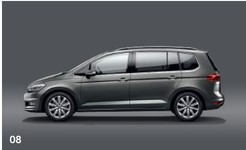
08 S SE SEF SEL RL