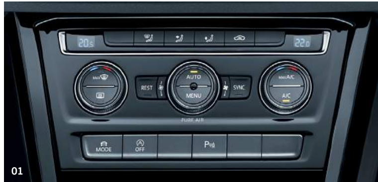
01-02 The climate control – 3Zone electronic air conditioning system allows the driver, front passenger and those seated in the 2nd row to set their own desired temperature, independently of one another. This advanced air conditioning system also features a 'gentle' climate option, making steamed-up windows a thing of the past, while the biogenic filter keeps out pollens and allergens, ensuring consistent air quality throughout the passenger compartment. Standard on SEL and R-Line and optional on all other models.

The panoramic sunroof adds a new dimension of fresh air and light to every trip. At 1.4m², it offers a stunning view of the skies above from every seat, enabling occupants to count clouds and stargaze to their heart's content. Electrically operated, the panoramic sunroof is fitted with an integrated roller blind and wind deflector, and at night is softly illuminated with LED ambient lighting. Day or night, driving's never been more fun.