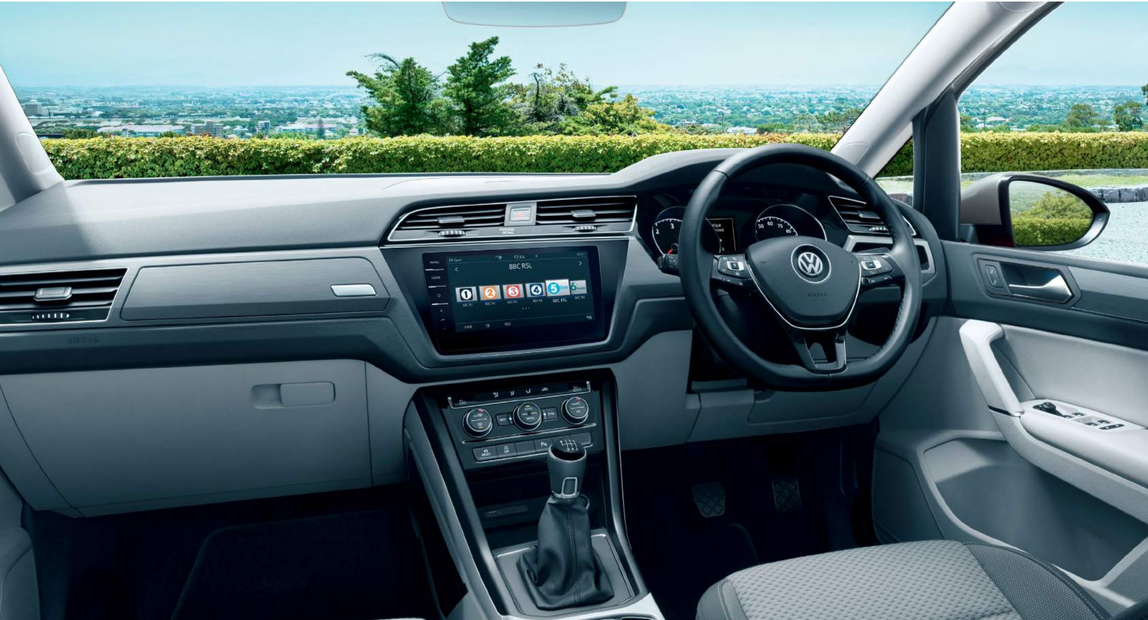
Interior shown is Touran SE Family with optional Discover Navigation Pro touch-screen navigation/DVD infotainment system with integrated voice activation, 3Zone electronic air conditioning, Driver Alert system and metallic paint.